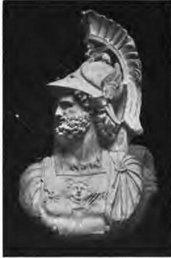
Fig. 29. Bearded Mars.

place to a much milder conception. In the fourth century B.C. he appears as a young man with spirited but somewhat thoughtful face, and slender, graceful, nude form. Often he has no arms